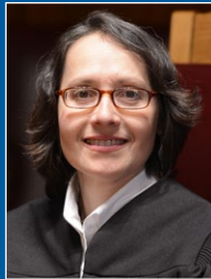
Hon. Jenny Rivera Court of Appeals