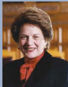
Hon. Judith S. Kaye

Thanks to your generous gifts to the Foundation for The Judith S. Kaye Youth Court Fund , nine grants have been awarded this year to support youth-related activities. Youth courts in Bethlehem, Warren County, Livingston County, Staten Island, Huntington, Ontario County, and Rochester have received funding from the Foundation. In addition, two grants to the Center for Court Innovation, New York, are providing funding to assist in developing a model operations manual for youth courts in New York State and to conduct research and analysis about juvenile crime in Brownsville, Brooklyn.