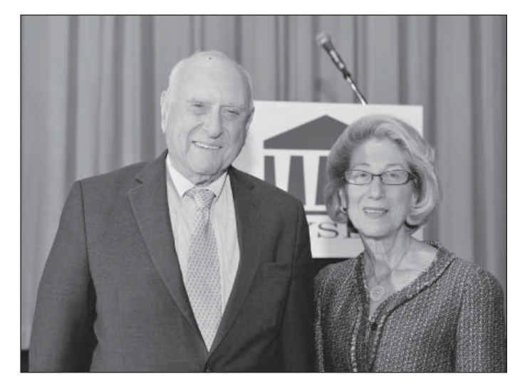
Eastern District Senior Judge Jack B. Weinstein presented the Fuld Award to Southern District Judge Shira A. Scheindlin.

B. Weinstein, United States District Court Judge for the Eastern District of New York. Upon accepting the Fuld Award, Judge Scheindlin spoke about the way in which digital technology has changed the practice of law. Since the amount of information people can store or communicate has increased exponentially in the past few decades, lawyers and judges today are required to utilize new concepts such as big data, data analytics, information governance, and cybersecurity. Judge Scheindlin emphasized that with the ability to access vast amounts of information also comes a potential for great loss of privacy. "Finding the balance between the two will be the great challenge of the next 25 years," she said.