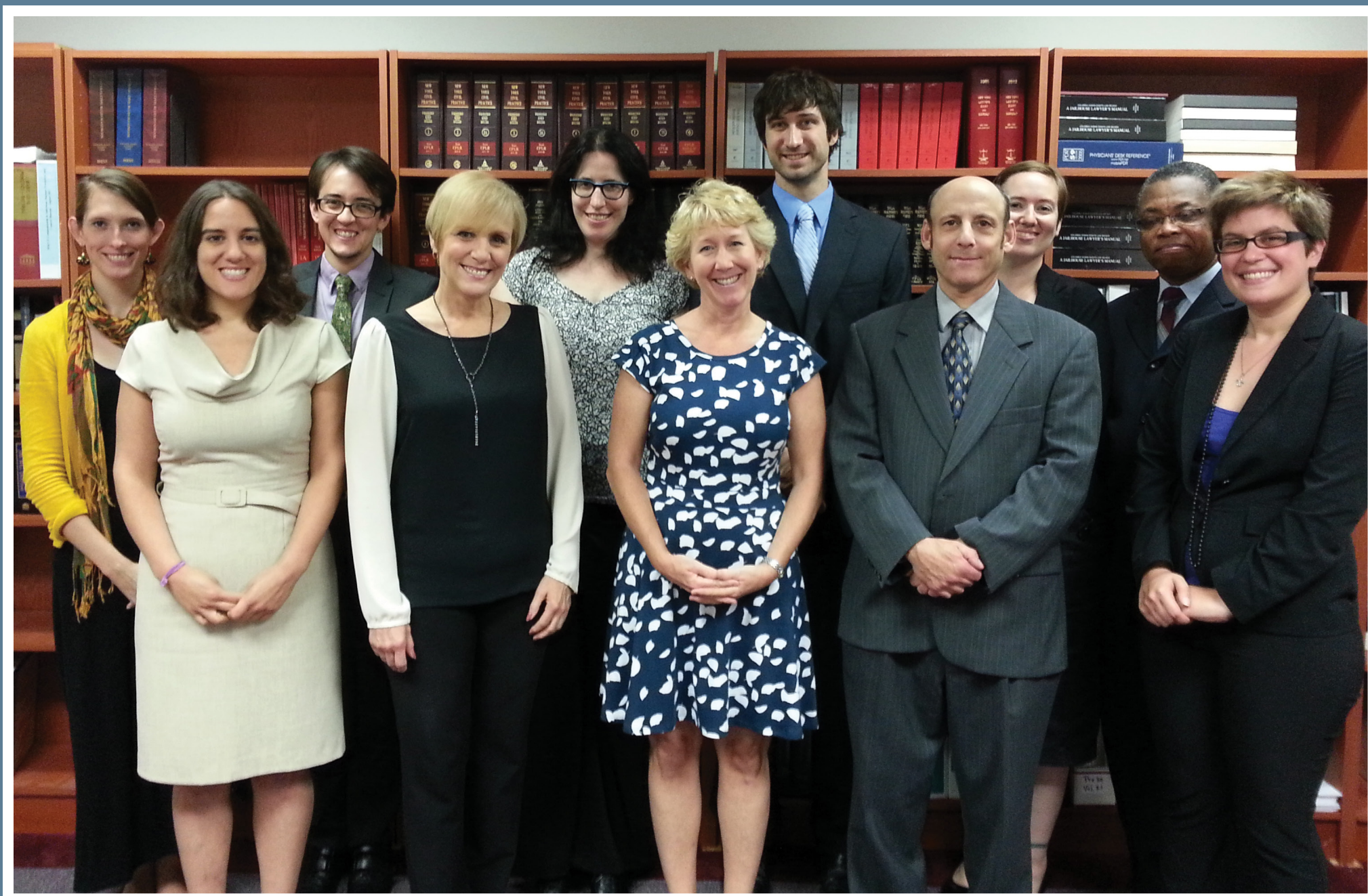
Nonprofit Organization Prisoners' Legal Services of New York Albany, New York

Senior Staff Attorney Empire Justice Center Albany, New York