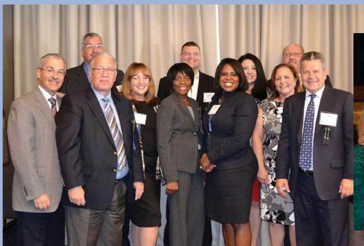
Section Chairs and Program Chairs with Fall Meeting Program Speakers