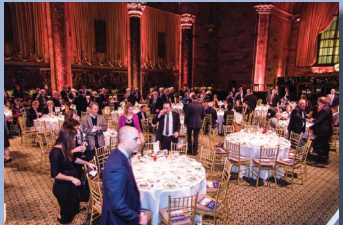
The TICL & Trial Dinner