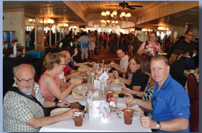
Attendees enjoying an afternoon on the Steamboat Natchez