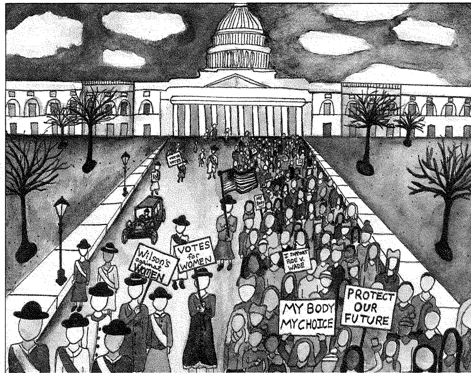
Civic pride —Three students from Hicksville, N.Y. created the winning artwork for the 2016–2017 Civics Poster and Essay Contest, which was jointly sponsored by the State Bar's Young Lawyers Section, and the Law, Youth and Citizenship Committee.

With requirements to include the American flag, all three branches of government and address at least one issue concerning the U.S. Constitution or its articles or amendments, many 11th and 12th graders in New York's 3rd, 4th, 5th, 9th and 10th Judicial Districts participated in the 2016–2017 Civics Poster and