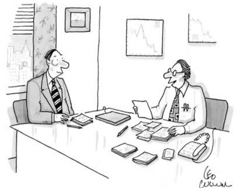
"Remember, 'accounting' and 'accountability': nothing in common."