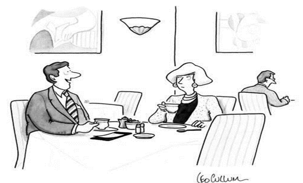
"Would you mind getting lunch? All my money is in a blind trust."