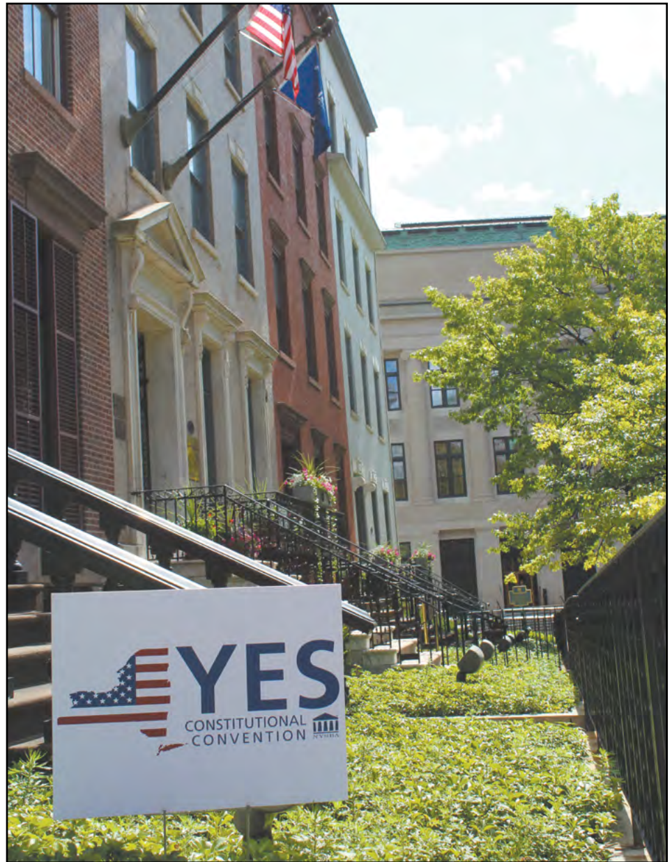
Convention campaign —the New York State Bar Association, its headquarters pictured above, is urging its in-state members and New York voters to say “yes” to a Constitutional Convention on November 7.

New York has 11 different levels of trial courts with different jurisdictions,