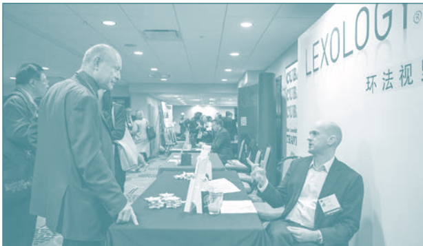
Exhibition Hall at the 2015 Spring Meeting