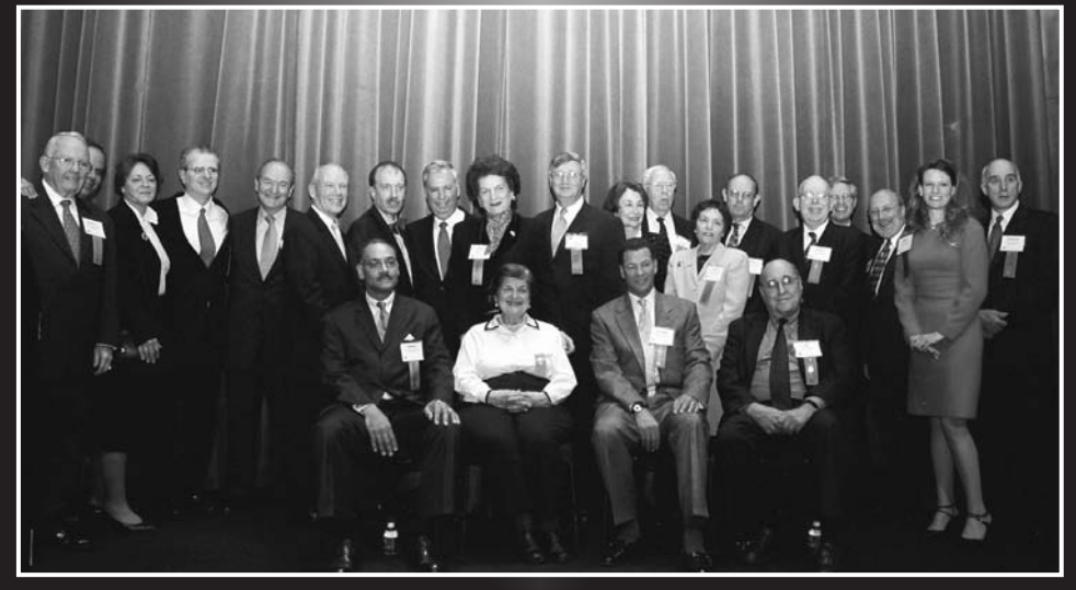
Commercial Division Judges