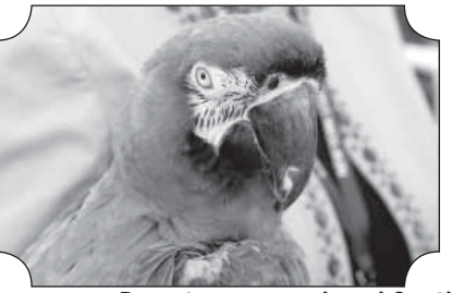
DO HOWE RAPHO

April 7-10, 2011 Turnberry Isle, Florida