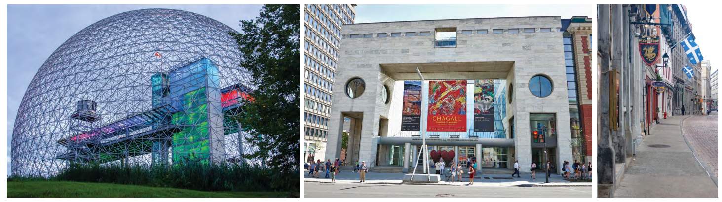
8 NYSBA Labor and Employment Law Section

Designated a national archaeological and historic site, the Museum of Montreal presents centuries of its history from the settlements of Indigenous People to the present day. Located on a spot occupied by humans for more than a thousand years and on the very site where Montreal was founded, the Museum is home to some remarkable architectural ruins that are showcased on site. Inextricably connected to its site, the Museum owes its development to important archaeological discoveries made in Old Montreal in the eighties. Inaugurated in 1992 as part of the 350th Anniversary celebrations of the City of Montreal, Pointe-à-Callière is the only substantial archaeological museum in Canada. It is also the largest and most visited history museum in Montreal.